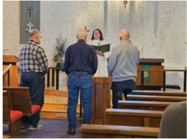
Honoring Veterans November 12