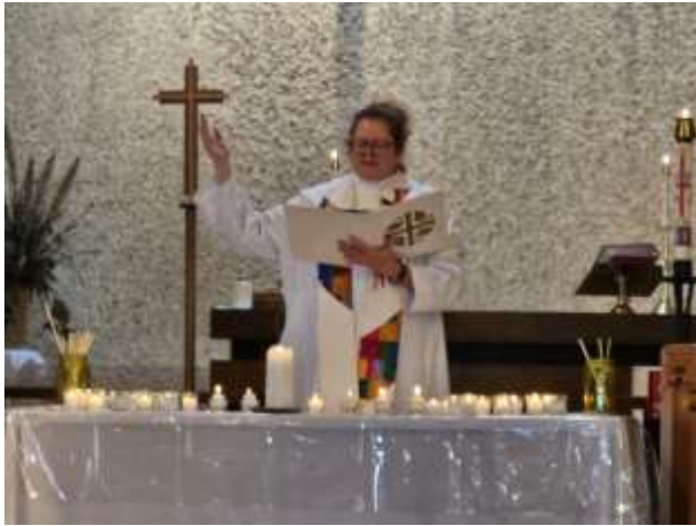
All Saints Sunday November 6